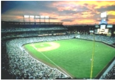
A mile high Coors Field baseball stadium