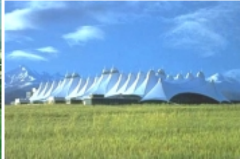
Denver International Airport